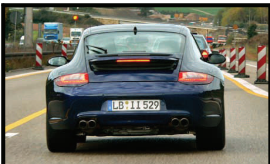
This Just In... 2009 911 Carrera S?

Those of you who are planning to go to Parade in San Diego in July, the event and registration forms, all 36 pages, are online now. I would pull them and print them now. Fill them out and have them ready to send in on March 6th. All of the events and prices on everything are there. So pull them up and have them ready.