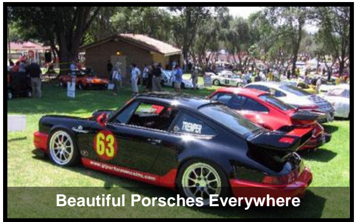
Beautiful Porsches Everywhere