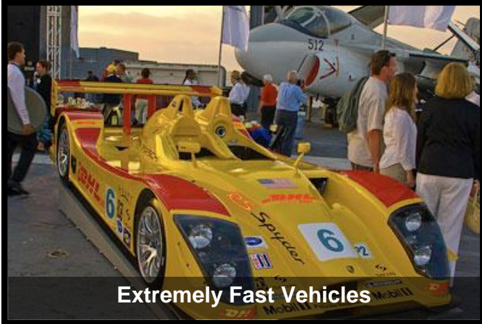
Extremely Fast Vehicles