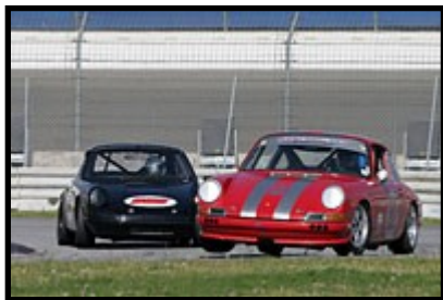
"Plavin Family Racing"

Next month's submission deadline – 11/23/07