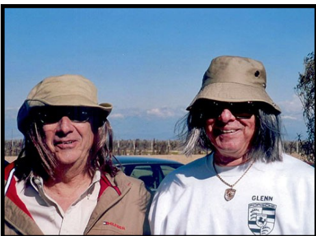
By: Glenn Pierce May POTM Submission Deadline 4/23/08