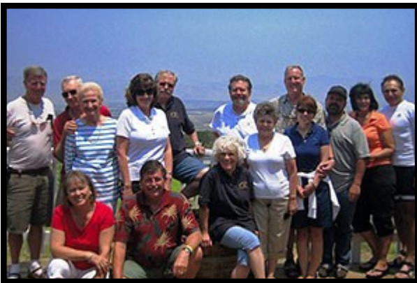
Monterey Tour Group at Hahn Winery

Our dinner meeting for August is at Jon's Bear Club in Reedley. This dinner is always a fabulous dinner. Make