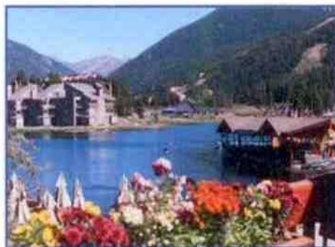
Lakeside Village