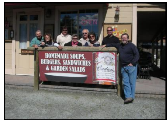
The gang outside of "Flap Jacks" in Tres Pinos, CA March 13, 2010