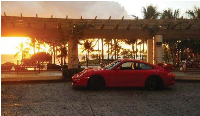
Porsche GT3 rented in Oahu for a PCA Hawaii event.