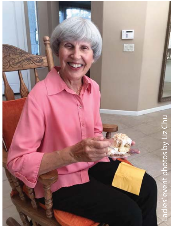
Ladies' event photos by Liz Chu