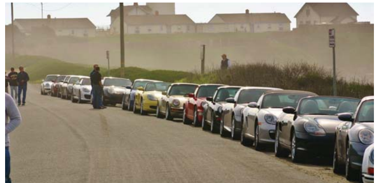
Thanksgiving Porsche Drive on Pacific Coast Highway. One of many drives that she did in the greater Bay Area.