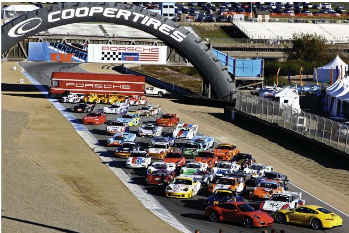
Rennsport Reunion IV Group Shot