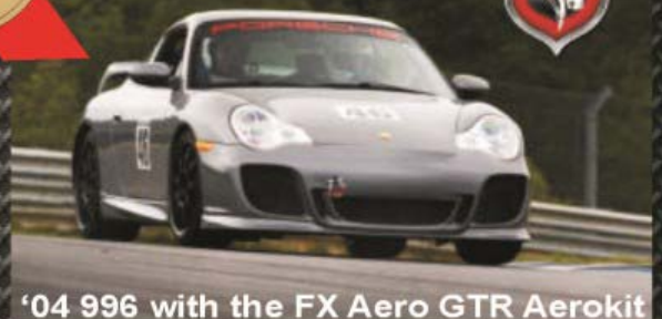
'04 996 with the FX Aero GTR Aerokit