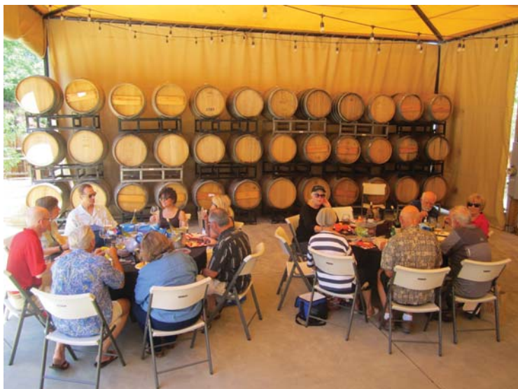
Lunch on the patio