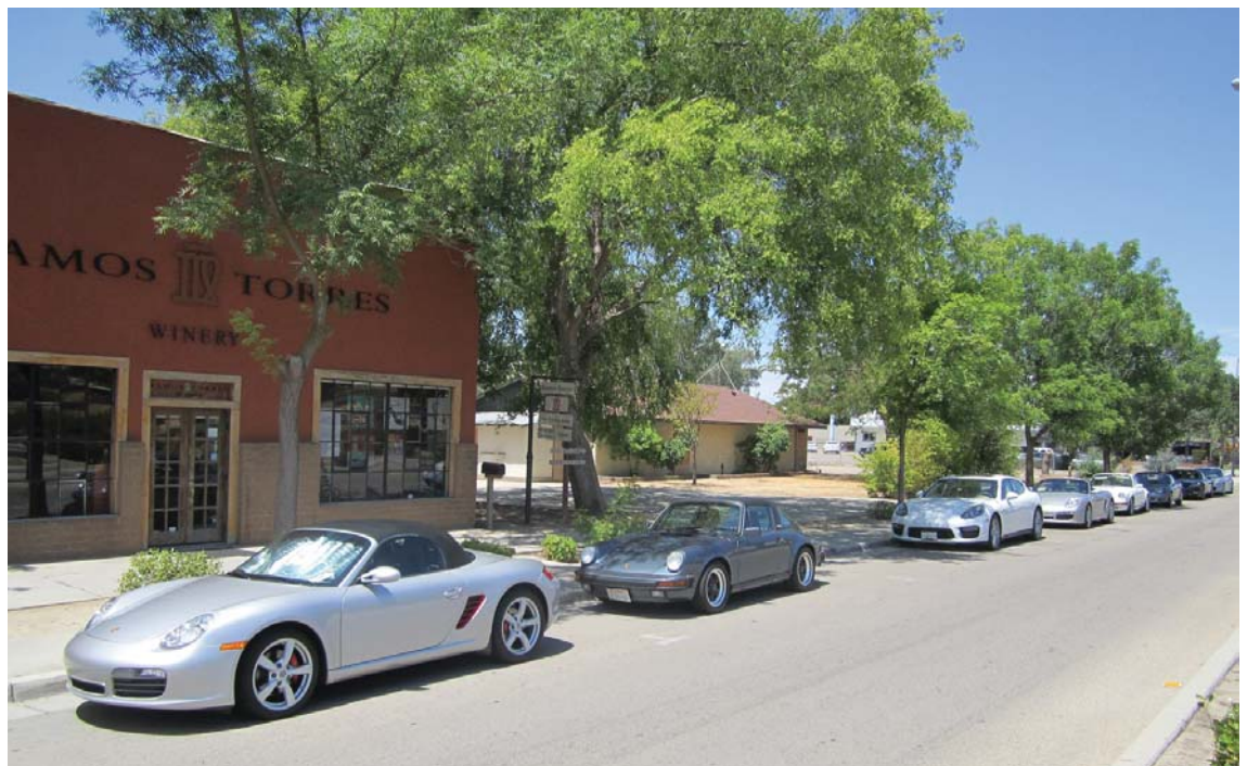
The Ramos Torres Winery