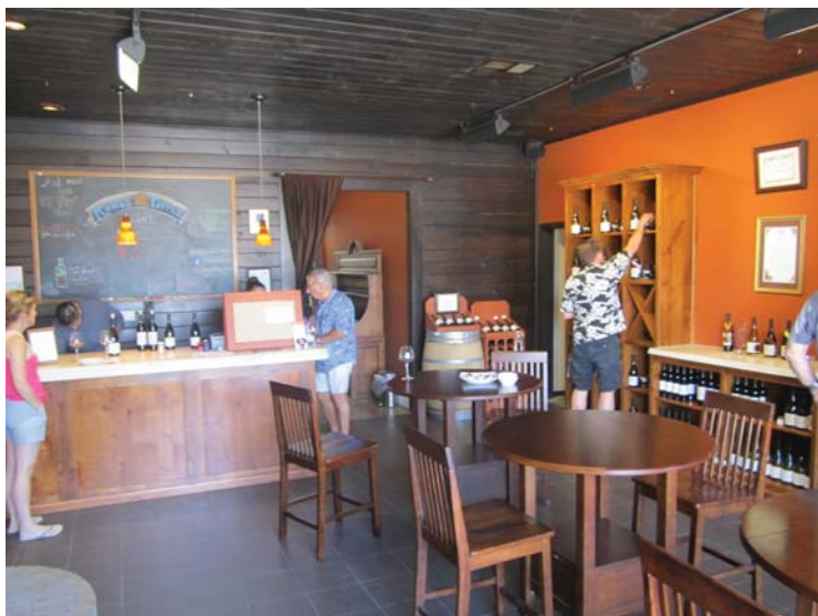
The tasting room