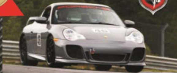
'04 996 with the FX Aero GTR Aerokit