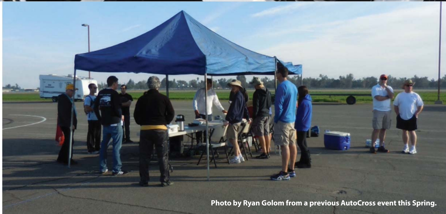
from a previous AutoCross event this Spring.