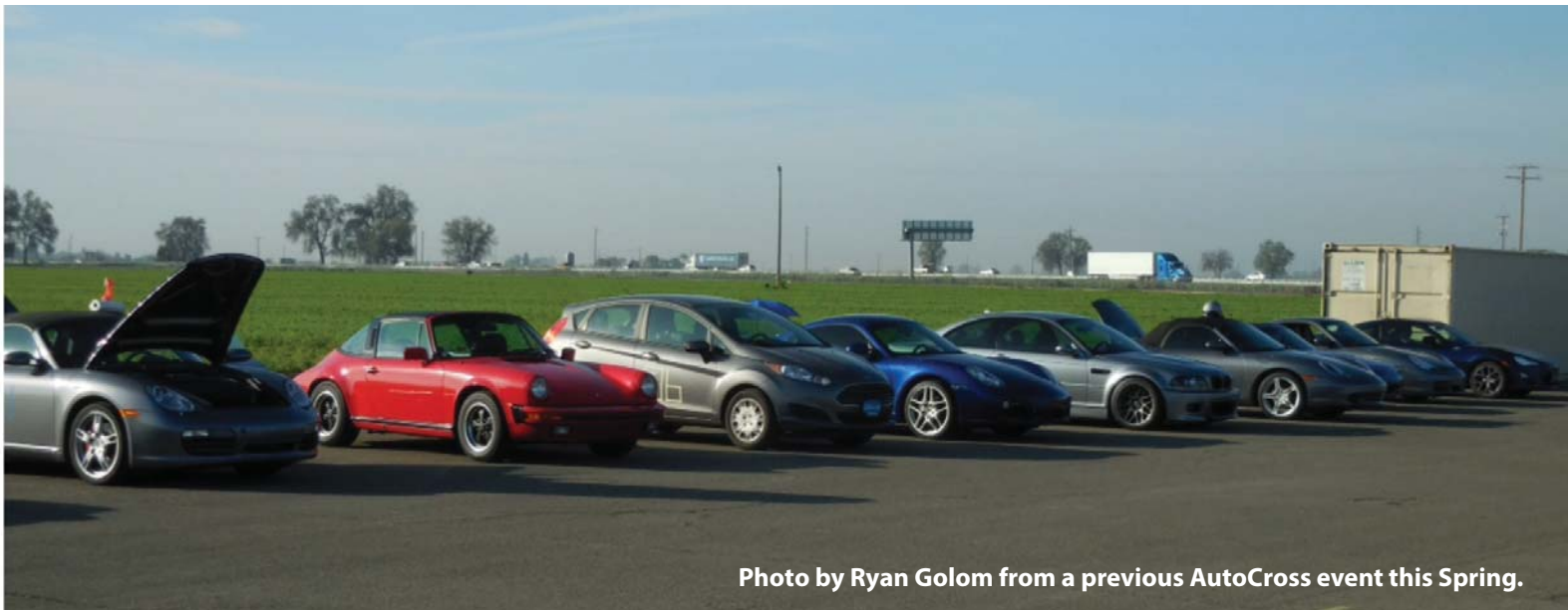
from a previous AutoCross event this Spring.