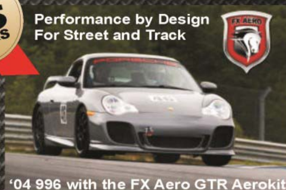
'04 996 with the FX Aero GTR Aerokit