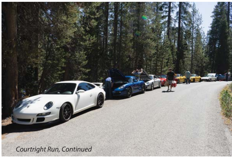
Courtright Run, Continued