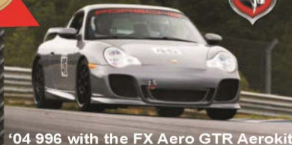
'04 996 with the FX Aero GTR AeroKit